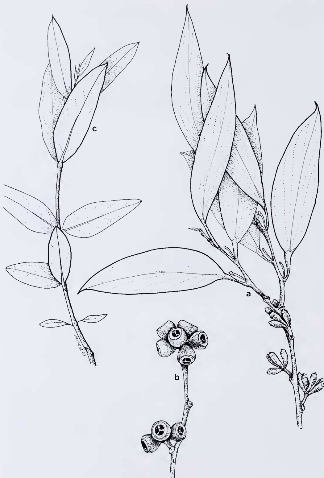
Fig. 4. Eucalyptus pauciflora ssp. parvifructa . a — branchlet with buds \times 1 . b — fruits \times 1 . c — seedling leaves \times 0.5 .